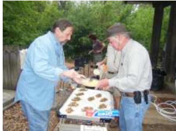
Woman vs. Men