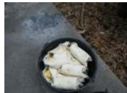
Breakfast made by the men