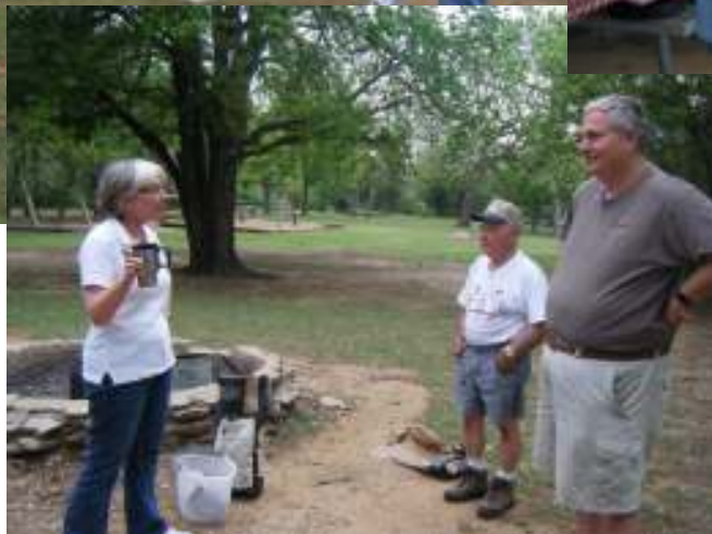
Above: Intent on story about the hospital Right: Getting advice from the experts